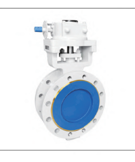
Triple-Offset Butterfly Valves DB1.2