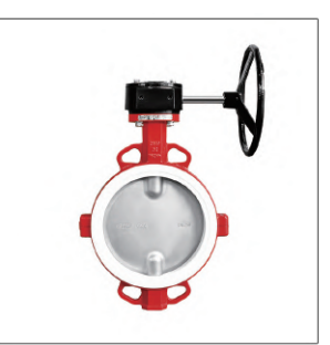
Lined Valves DM8.5