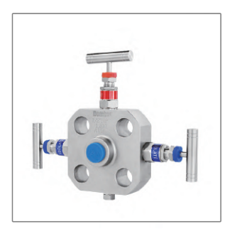
Needle Valves DM8.1

The one-stop-shop selection of industrial valves we offer includes needle valves, cryogenic valves, lined valves, and many more. Every valve is made to handle intense pressure and allow for easy flow maintenance thanks to its construction.