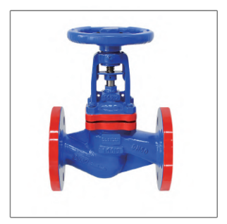
Bellows-Sealed Globe Valves