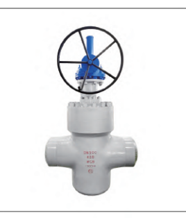
Slab GateValves DG3.2