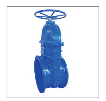
Resilient Seated Gate Valves