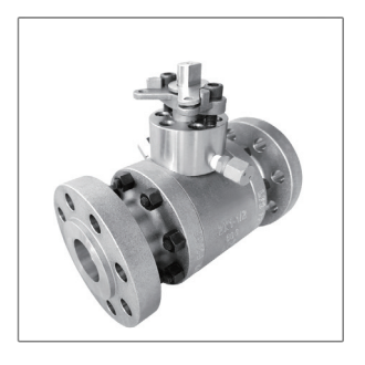
Floating Ball Valves DQ2.1

You can find floating ball valves, way ball valves, port ball valves, and many more in our product offering. Each of our ball valves has a compact and lightweight design, making them compatible with various piping systems.