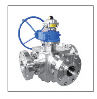
3-Way Ball Valves DQ2.3