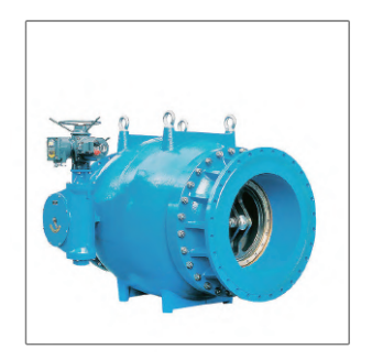
Non-Slam Check Valves DC5.4