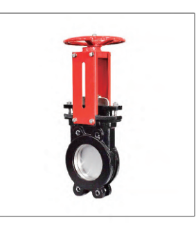
Knife Gate Valves