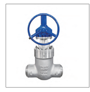
Wedge Gate Valves DG3.1

The range of DomBor gate valves we provide includes wedge gate valves, slab gate valves, and knife gate valves. Gate valves we produce are constructed to allow the medium's flow to pass through without obstruction as well as to restrict it entirely.