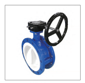
Concentric Butterfly Valves DB1.1

Lightweight and compact, our butterfly valves can be integrated with large-diameter pipes that handle liquid and gas mediums. The butterfly valves we have include high-performance butterfly valves, triple-offset butterfly valves, and flange butterfly valves.