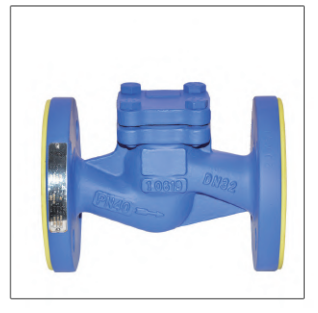
Lift Check Valves DC5.2