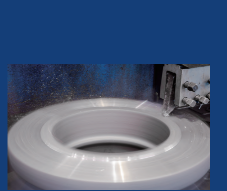
8 Sets of 1.6-meter Vertical Lathes

Adopting a culture of innovation and development throughout the company, implementing effective management protocols, employing modern production systems, and adhering to quality guidelines-all this enables each of our departments, and our company as a whole, to flourish.