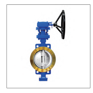
Wafer Butterfly Valves DB1W