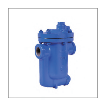
Steam Traps DM8.6