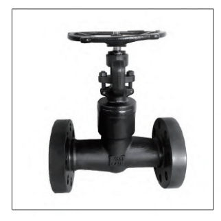
Forged Valves DM8.3