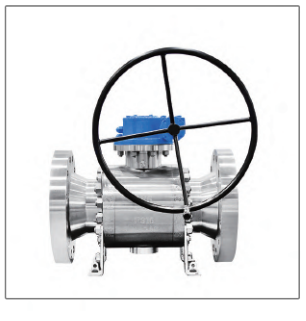
Trunnion Ball Valves DQ2.2