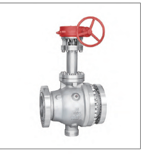
Cryogenic Valves DM8.2