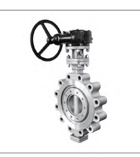
Lug Butterfly Valves DB1LW