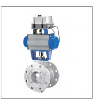
V-Port Ball Valves DQ2.5