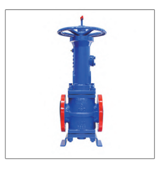
Double Block and Bleed Plug Valves