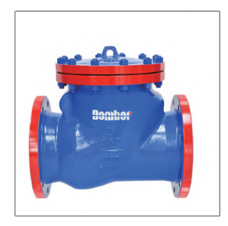
Swing Check Valves DC5.1

Select from our complete range of check valves for any business requirements including our swing check valves and lift check valves. Each of our check valves is designed to maintain intense pressure and prevent backflow.