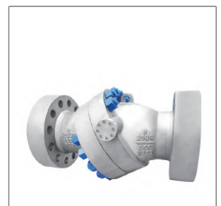
Tilting-Disc Check Valves